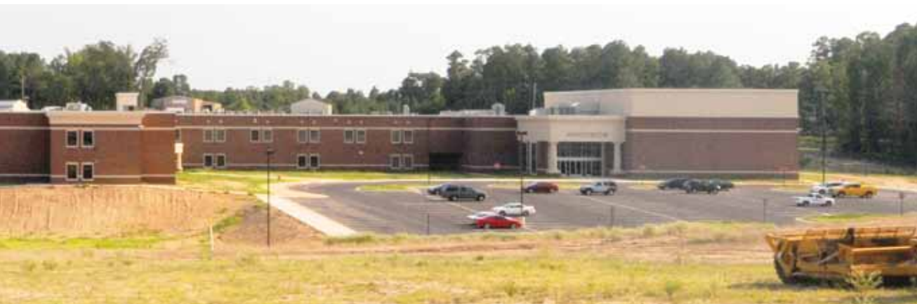
El Dorado High School, El Dorado, Arkansas

There may not be many schools as large as the El Dorado example with such a varied program. What is significant, however, is the cost savings that can be expected by going with a wood construction system, whether the building is modest or not so modest. Couple this with being able to validate local industries and thereby have an effect on local economies and community support and it makes even more sense.