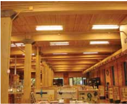
Lee Valley Tools, Toronto, ON Turn of the century wood building located on King Street in Toronto.