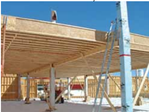
Timmins Library, Timmins, ON Light wood-frame construction

The particulars of a project identified prior to and during the design phase may point to one construction system over another. There are several wood construction systems to choose from that meet the needs of most, if not all, low-rise school buildings. While it is true that buildings can be built using only one construction system, more often than not combinations of the following systems form the basis for design solutions.