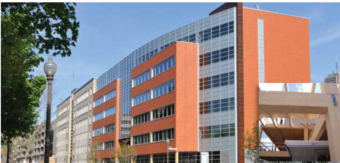
Édifice Fondation CSN, Quebec City, QC The only 6-storey office building of post and beam construction in North America, allowed using the alternative compliance path of the National Building Code of Canada. Photo: Gilles Huot architecte

For an innovative or a proprietary wood product or process to be accepted for alternative compliance as it relates to structural design, the requirements of CAN/CSA-O86 Clause 13, Proprietary Structural Wood Products – Design , and Clause 14, Proprietary Structural Wood Products – Materials and Evaluation , must be met and acceptance granted by the authority having jurisdiction.