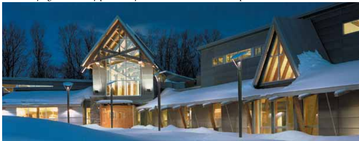
Haliburton School of the Arts, Fleming College, Haliburton, ON