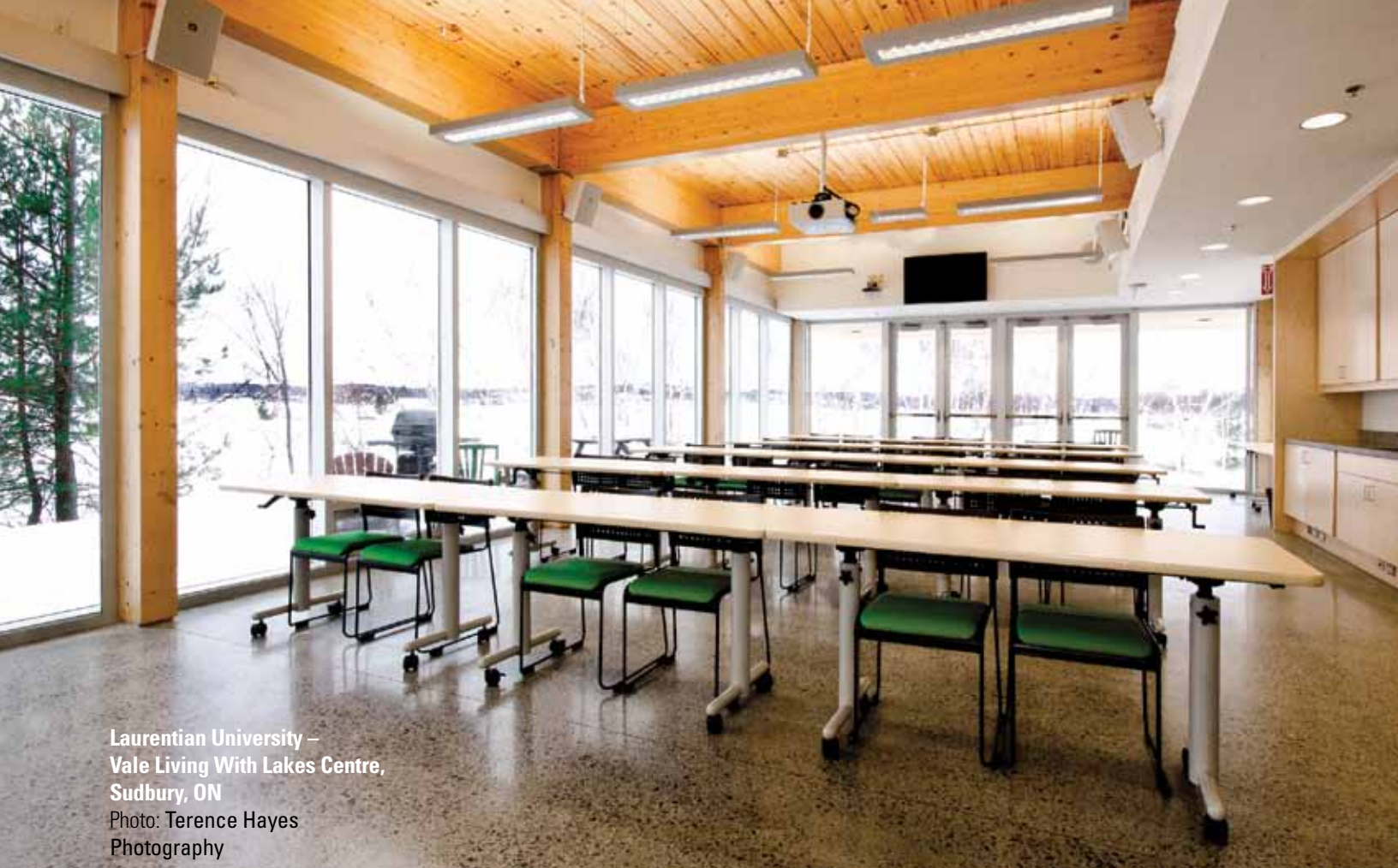
Laurentian University – Vale Living With Lakes Centre, Sudbury, ON