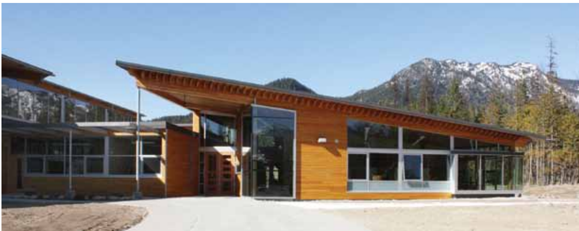
Crawford Bay Elementary-Secondary School, Crawford Bay, BC Photos courtesy of: KMBR Architects Planners Inc.