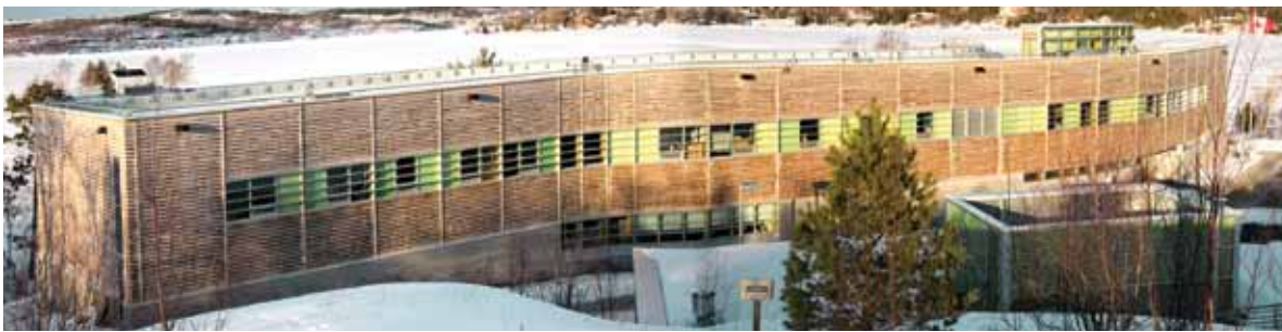
Laurentian University – Vale Living With Lakes Centre, Sudbury, ON Exterior wood cladding

the building type, the seismic considerations and the resistance required. Typically, wood construction systems are not limited by seismic considerations in 2-storey buildings and often demonstrate superior performance, even in higher structures, when subjected to such forces.