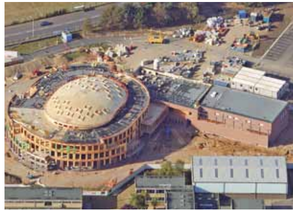
Open Academy, Norwich, England The CLT structure for the 3-storey Open Academy building was erected in 17 weeks and saved the program 18 to 20 weeks overall. The sports hall was erected in 4 days.

With a CLT construction system, all major structural aspects are completed before the panels arrive on site. Computer controlled precision using Computer Numerical Controlled (CNC) machines for cutting openings in wall components makes it possible to start installing doors and windows as soon as the panels are assembled and levelled, thereby greatly reducing the operational time of the construction site. In addition, since no concrete works are needed after the foundation is poured, work during the winter months is facilitated. With a CLT construction system, site waste is reduced to a minimum and building occupation is timely.