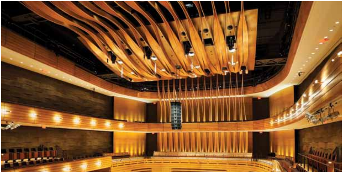
The Royal Conservatory, Koerner Concert Hall, Toronto, ON Wood interior finish in a non-combustible building

use as a means of egress. Use can also be affected by whether the building is sprinklered and pertinent fire-protection and fire-resistance ratings of adjacent building elements, as well as by distance to the property line. There are flame-spread rating requirements for interior finishes, walls, ceiling and sometimes floors, among other specified restrictions. Most wood finish materials can meet flame-spread rating requirements for walls and floors. The restrictive flame-spread ratings for ceilings limit the use of wood ceiling finishes, however, and often require the use of fire-retardant treated wood.