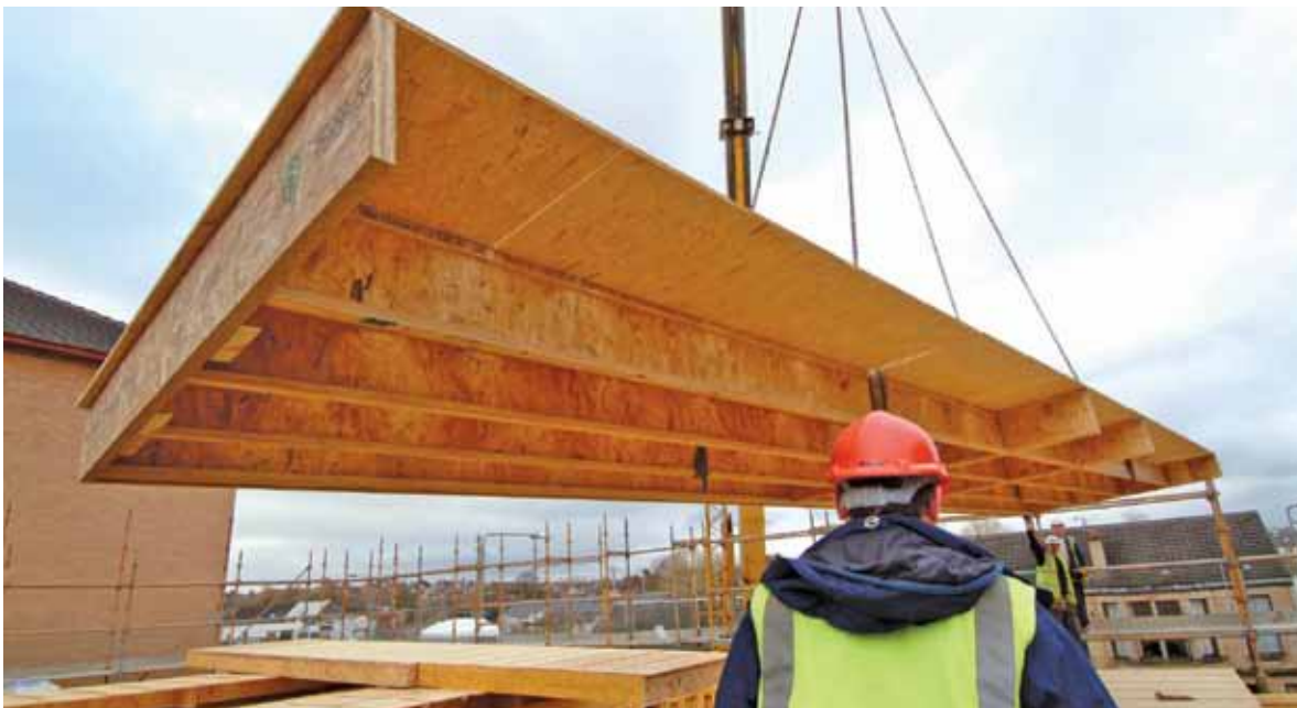
5-Storey Apartment Block Pre-fabricated floor system installation