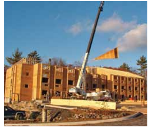
Microtel Inn & Suites, Parry Sound, ON Factory-built panelized wall systems allowed framing to be completed in 60 days without compromising quality, consistency or cost effectiveness.

Complete walls, floors and roofs can be pre-fabricated or panelized in a controlled environment. These pre-fabricated systems are essentially light wood-frame construction with all of its benefits – light-weight, easy and quick to install, economical – taken in out of the rain. Weather is eliminated as a factor to contend with so quality control and detailing are enhanced. Panelized components can be fabricated to virtually any size or shape thereby creating a limitless potential for architectural expression.