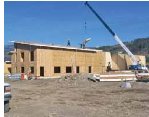
Elkford Community Centre, Elkford, BC The first commercial application of CLT tall wall panels in North America.

PWFs provide a cost-effective alternative for foundation systems in conjunction with light wood-frame construction systems. They are easily installed in winter and, since only one trade is required on-site, construction scheduling is more efficient. PWF materials can also be easily transported, making this form of foundation a good choice for remote communities. Proper detailing is of paramount importance, however, and the expertise of installers must be assured. A reference book entitled Permanent Wood Foundations is available from the Canadian Wood Council.