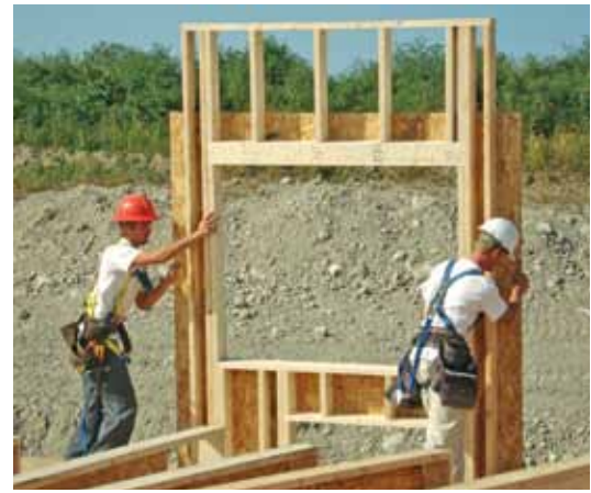
Microtel Inn & Suites, Parry Sound, ON

What's best for society in the context of constructing low-rise school buildings? For a strong society, people need to be engaged – both at work and at home. When local industries are not validated, the result is a workforce that migrates out of our communities thereby eroding the very fabric needed for a strong society. The Ontario forest industry supports more than 200,000 direct and indirect jobs in over 260 Ontario communities. 9 Of these communities, 40 depend primarily on the forest sector for their survival and another 63 would be severely affected should it disappear. The use of local industries in the construction of school buildings not only keeps the Ontario economy strong, it employs its citizens and helps to create the strong communities that are needed to sustain Ontario's society.