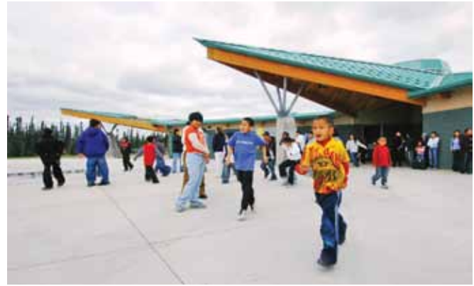
Deer Lake Community School, Deer Lake ON Kindergarten – Grade 10

This guide has been prepared particularly with low-rise school buildings in mind, that is to say elementary, middle and secondary schools found throughout Ontario. It was not prepared with university buildings in mind, per se, although much of the information contained herein is applicable to low-rise school buildings found on university campuses. In fact, the information is applicable to a broad range of low-rise educational buildings, including those found in remote communities which serve multiple functions, such as schools with combined community centres or adult education complexes and municipal libraries. Informed decisions on construction systems for these and other buildings start with an understanding of the underlying theme in any present-day endeavour, sustainable development.