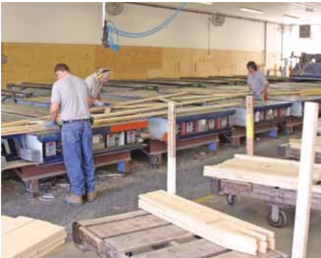
Mar-Span Truss Inc., Drayton, ON