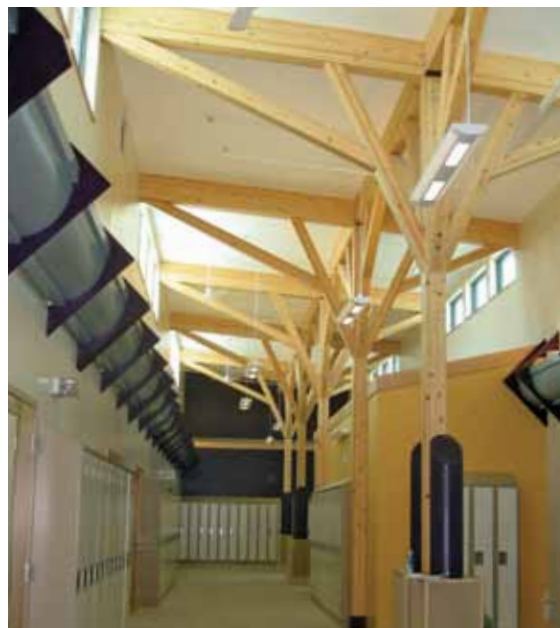
École secondaire de la Vérendrye